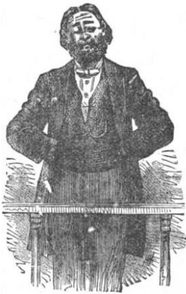
Placing the arms akimbo 24

Other humorous postures to be avoided were: