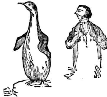
Placing the thumbs in the arm holes of a waistcoat, or “The Penguin” 25

As far as dress was concerned, Spurgeon urged his students to worry less about fineries and more about their messages. He ridiculed “clerical foppishness” with all its dressiness and finely-combed hair. He included the next illustration when recounting how, twenty years earlier, a newspaper artist had dubbed him “Brimstone” and another “Jack-a-dandy” preacher as “Treacle” (see figure below).