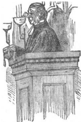
THE VERY REVEREND DR. PAUL PREACHING IN LONDON

In volume two, 15 in a similar vein to the lecture on the voice, Spurgeon advised young preachers to avoid distracting motions and bad habits in the pulpit. He sympathized with those who had to preach from traditional pulpits (versus platforms) because of the difficulty presented by their constriction. He contrasted Italian Renaissance artist Raphael's powerful depiction of Paul preaching at Athens with the very stiff, tongue-in-cheek "Very Reverend Dr. Paul in London":