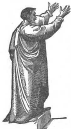
PAUL PREACHING AT ATHENS, AFTER RAPHAEL

The preceding lectures can be found in the first published volume of Spurgeon's Lectures .